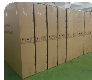
02 Packed in carton