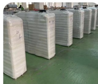
01 Packed in protective film and pearl cotton