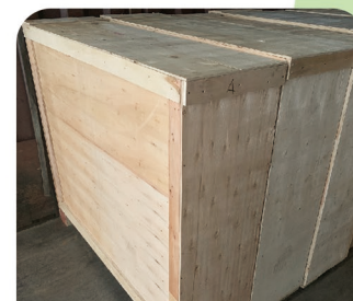
03 Packed in standard export wooden cases